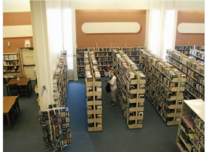
North Las Vegas Library