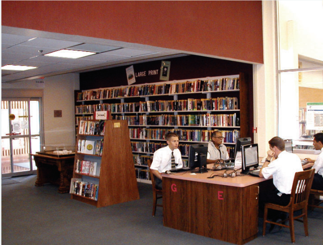
Library District computer lab