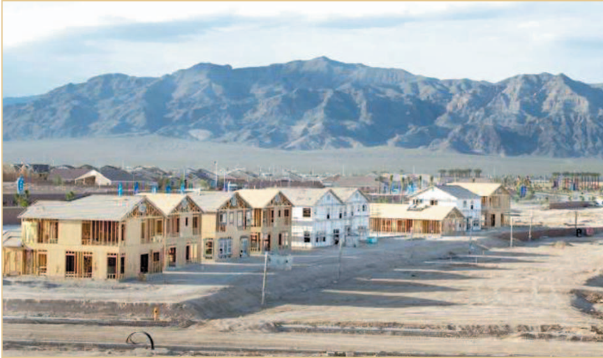
Construction underway at Aliante.